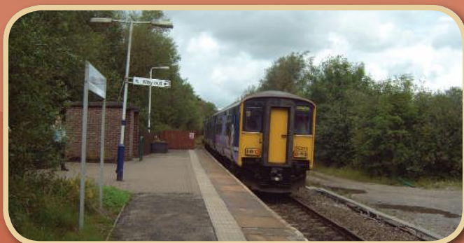
Entwistle 17th August 2007