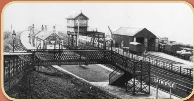
Entwistle circa 1903