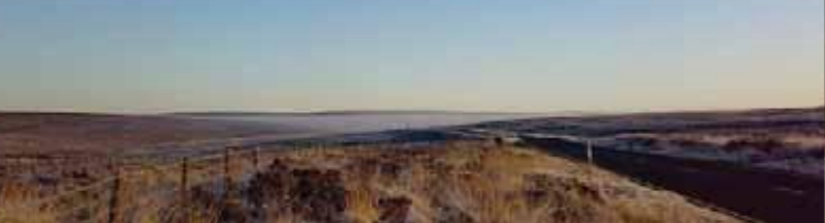
Blackstone Edge, South Pennines