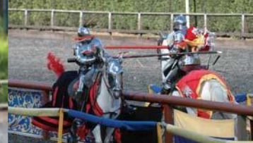
Jousting at Royal Armouries, Leeds