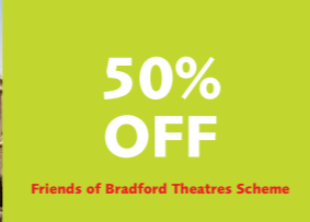
Friends of Bradford Theatres Scheme