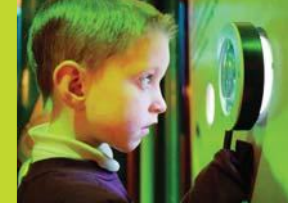
Spider exhibition, Eureka!