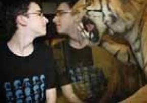
The Manchester Museum