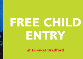
at Eureka! Bradford