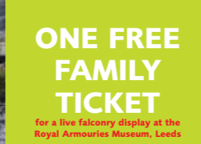
for a live falconry display at the Royal Armouries Museum, Leeds