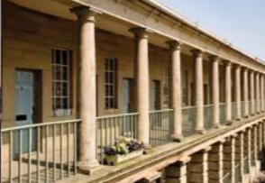
Piece Hall, Halifax