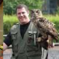
Falconry at Royal Armouries, Leeds