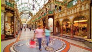
Victoria Quarter, Leeds

at Royal Armouries Museum Shop and The Manchester Museum Shop